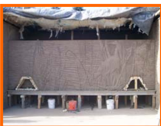
Public Art Project in Ft. Collins