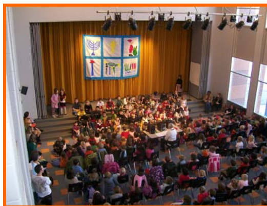
Backdrop at performance