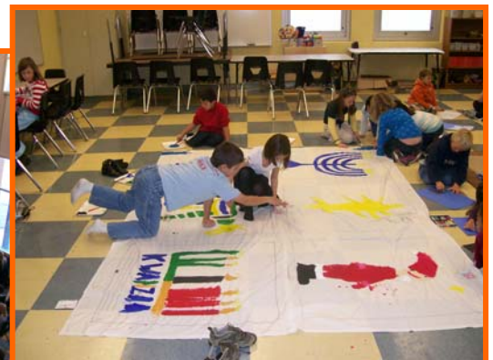
2 nd Graders create backdrop for Musical