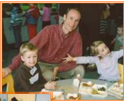
WCE Families enjoy the annual Thanksgiving lunch in the school cafeteria.

Anything else you want people to know about you? My favorite colors are pink and purple.