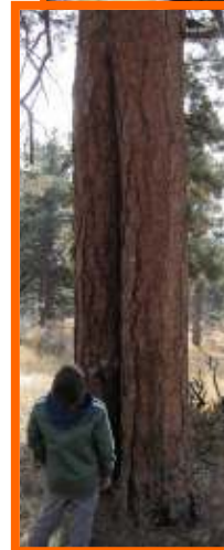
“That’s one BIG tree” (written by Ben Perez)